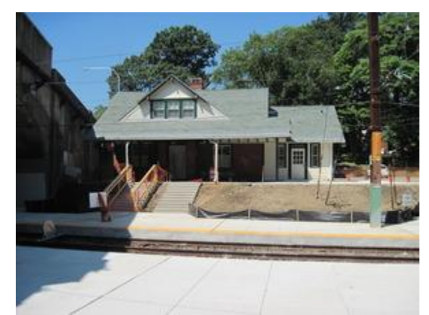
View of the platform after the demolition of the shed