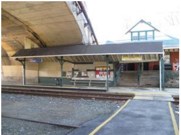
View of the shed before demolition