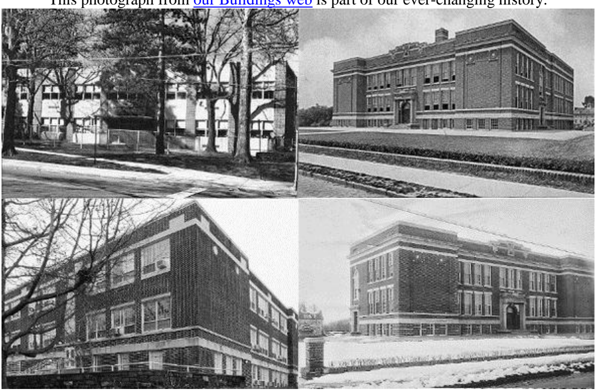
Timeline for the Cynwyd School

This photograph from our Buildings web is part of our ever-changing history.