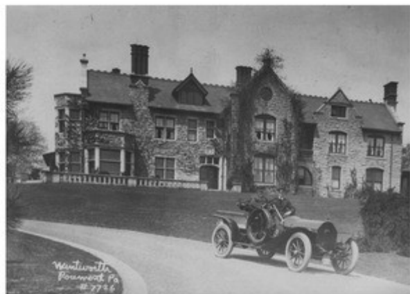
Wentworth Farms (1912)