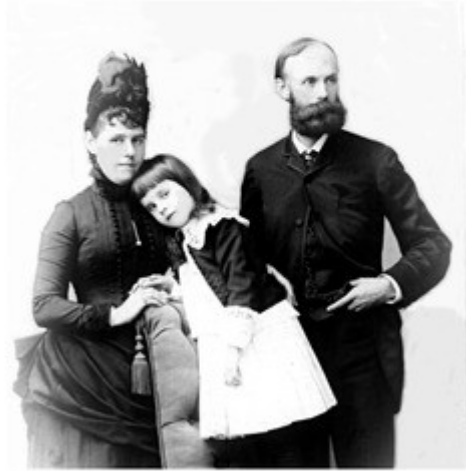
Lippincott Family (1886)

Sign up for our workshop on May 1 st and learn to “do it yourself”!