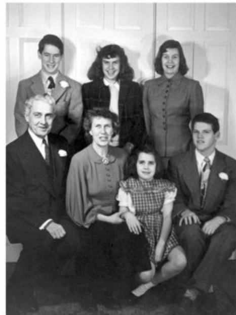
Saunders Family (1949)