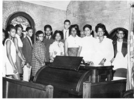
Zion Baptist Choir (1981)