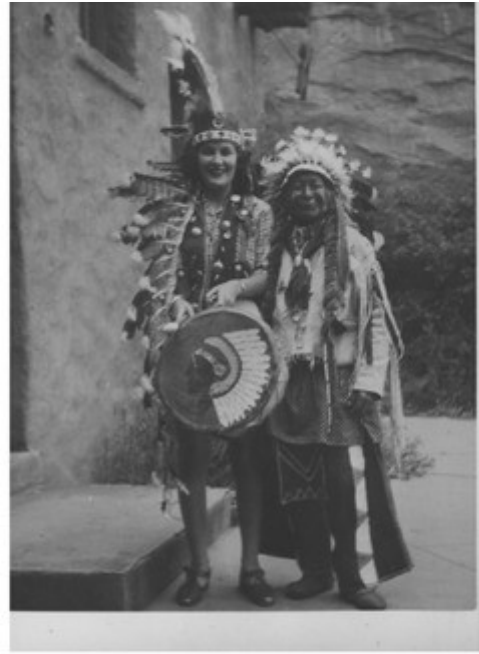
On Vacation, Hidden Inn, Colorado (1944)