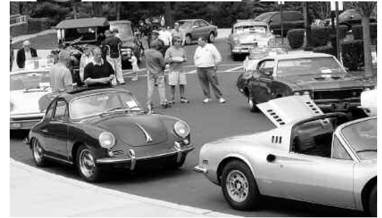
Neighbors out perusing the 40 antique cars on display at the Bala Cynwyd Middle School circle.